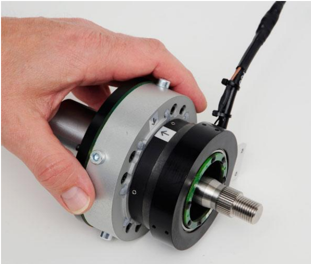
Small, flexible and high-precision: The new steering effort sensor KMT-CLS

Measurements at the original steering wheel of automobiles and trucks